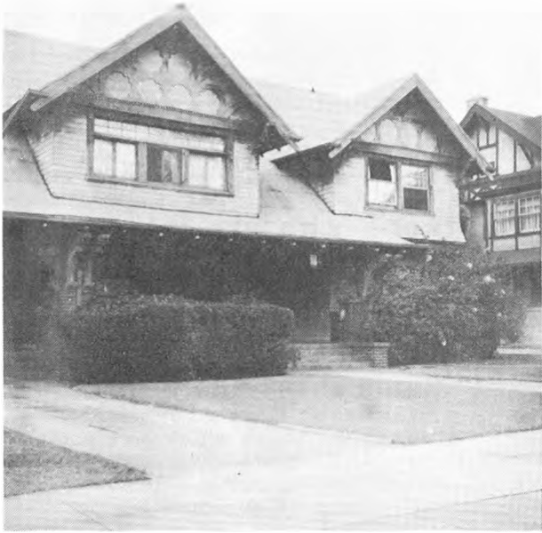
HASI headquarters in Los Angeles, Calif.