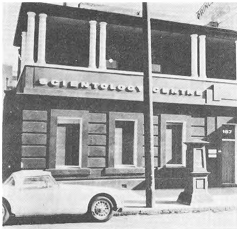
SCIENTOLOGY CENTRE HASI headquarters in Melbourne, Australia