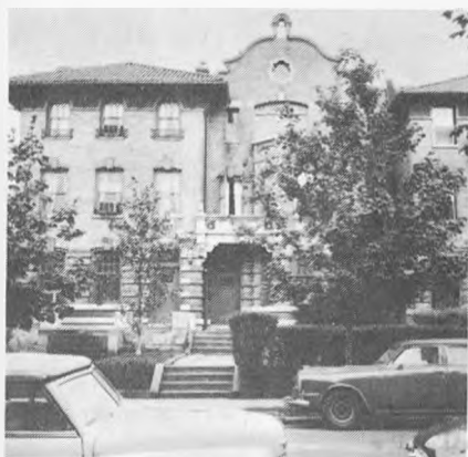
"The Academy"--1810 and 1812 19th Street, N. W.