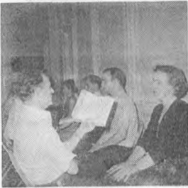
'Coaches' and 'Auditors' at work on Preclear Originations.