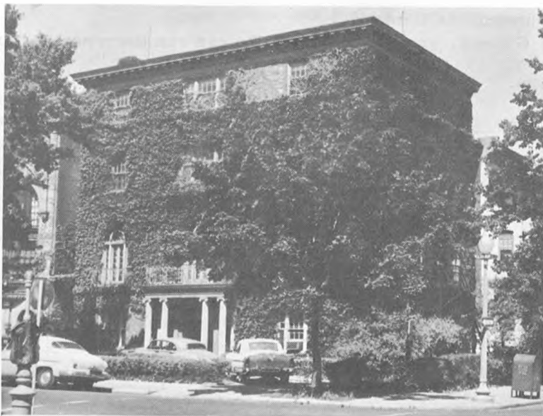
Vine-covered building at 1701 19th Street housed the 18th A. C. C.